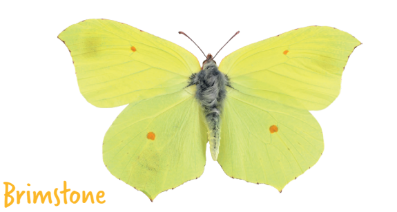
Average wingspan: 60mm