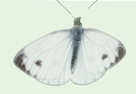
Large white Average wingspan: 67mm Black marks at the wing tips, with black colour continuing along the outer edge of the wings.